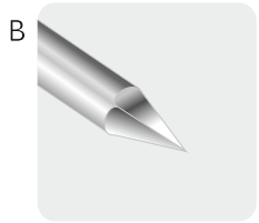
B Stylet with pyramidal tip