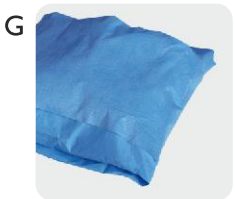
G Coupled sheet for sterile field