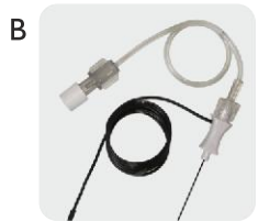
B AEQ needle Quincke tip