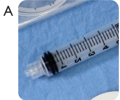
A 5 ml syringe with Luer Lock cone