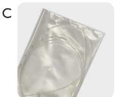
C Catheter, closed tip with side holes