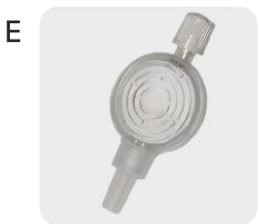
E Filter 0,22µ 0,65 ml priming volume