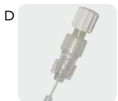
D Connection between catheter and filter